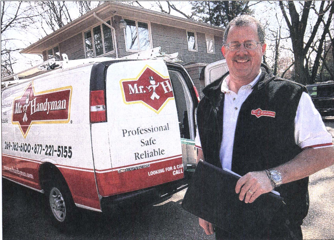
Small-business advisers see uptick in start-ups, 2005-2009